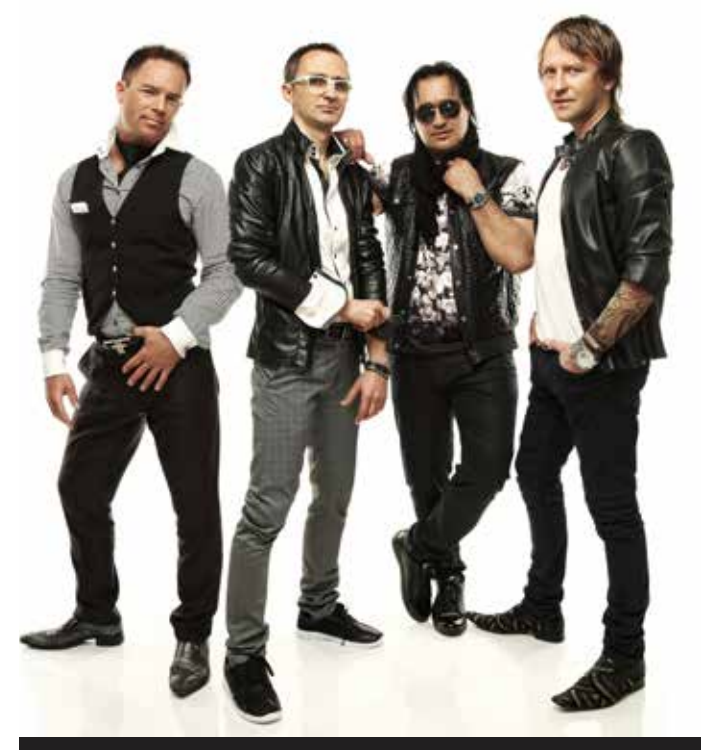
SATURDAY NIGHT, JANUARY 6 | Big stage in KRANJSKA GORA