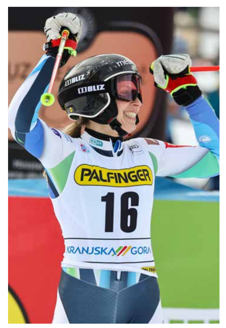
Golden Fox, Kranjska Gora 2023

I want them to enjoy skiing above all. It's what drives you through tough times. You have to love this sport. You have to work and work again, but you also have to have a good time, have fun. I wish that the tradition of the Golden Fox will continue for a long time and that Slovenia will have many good competitors in the future as well.