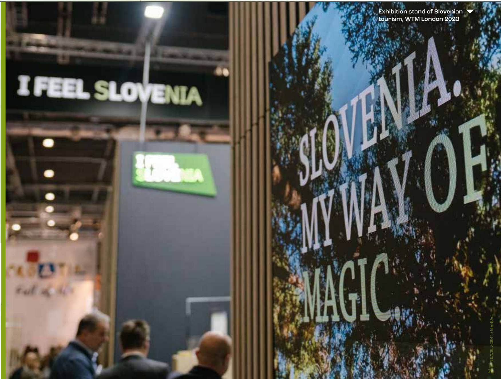
Exhibition stand of Slovenian tourism, WTM London 2023