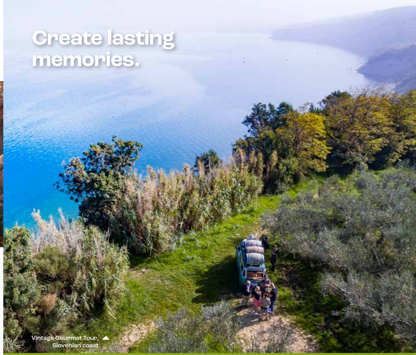
Vintage Gourmet Tour, ▲ Slovenian coast

Slovenians, known for their hospitality and foreign language proficiency, invite their guests to enjoy the same lifestyle that they have – in touch with nature, with respect to local, and with passion for sustainability.