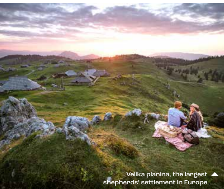
Velika planina, the largest shepherds' settlement in Europe ▲