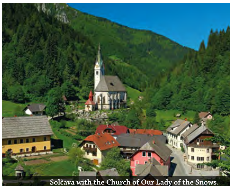
Solčava with the Church of Our Lady of the Snows.