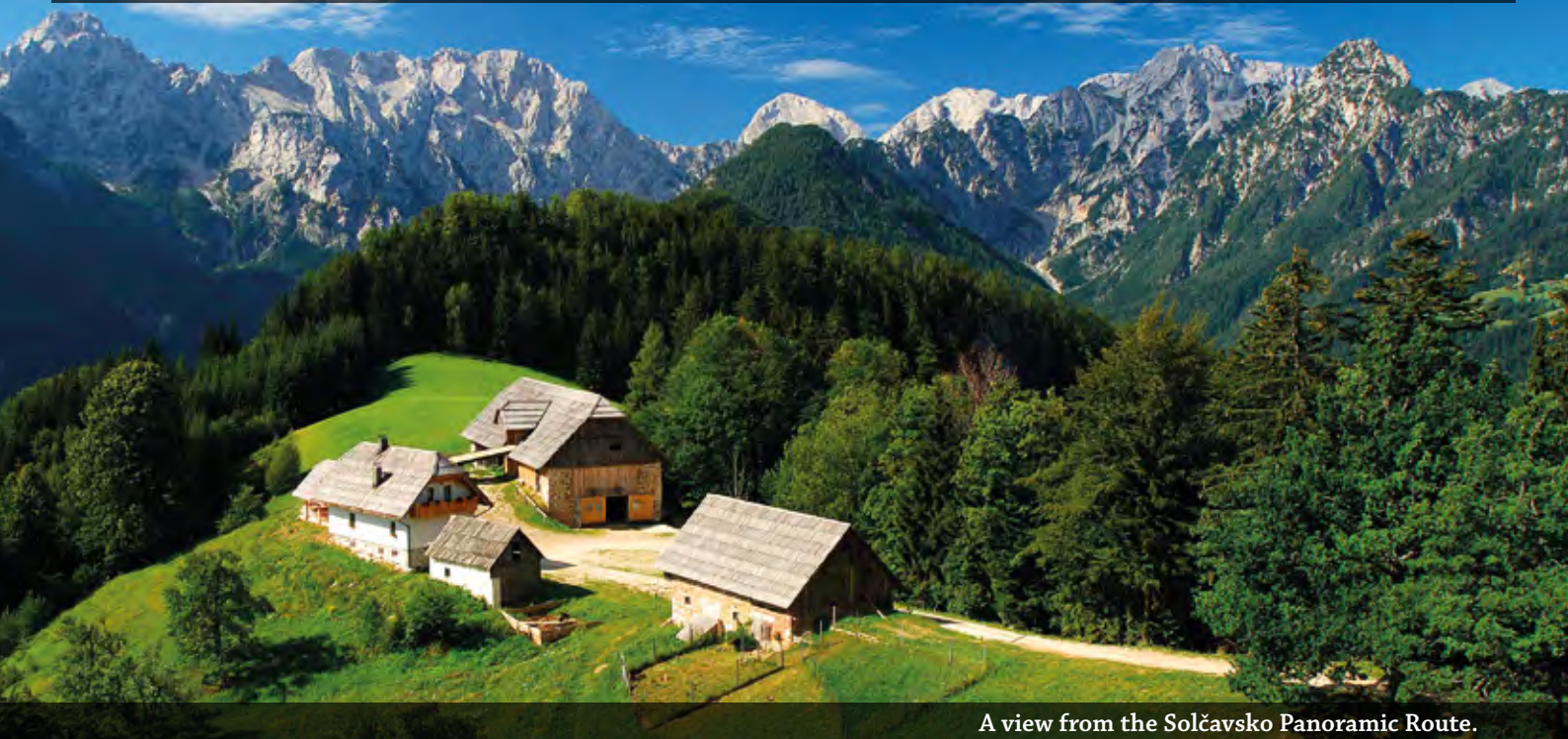
A view from the Solčavsko Panoramic Route.

The stunning Alpine peaks, the idyllic beauty of three glacial valleys, a nature park containing countless natural and cultural sights of interest, the hospitality of the people, the profusion of traditional crafts and dishes: these are just fragments of the big picture of the coexistence of unspoilt nature and human creativity. The Solčava District (Solčavsko) is three valleys in harmony and at the same time the unison of outstanding natural beauty and carefully considered tourism.