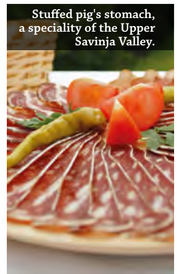
Stuffed pig's stomach, a speciality of the Upper Savinja Valley.