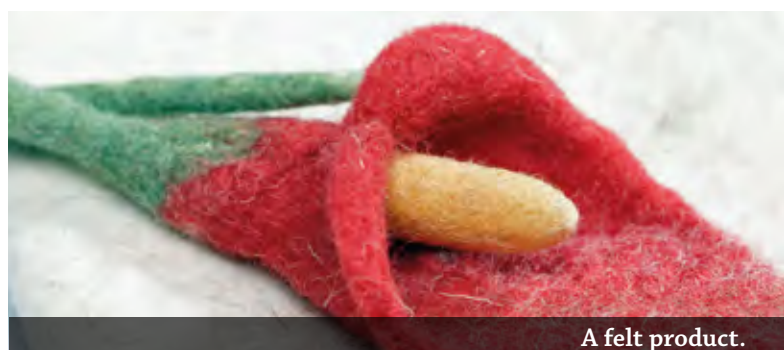
A felt product.