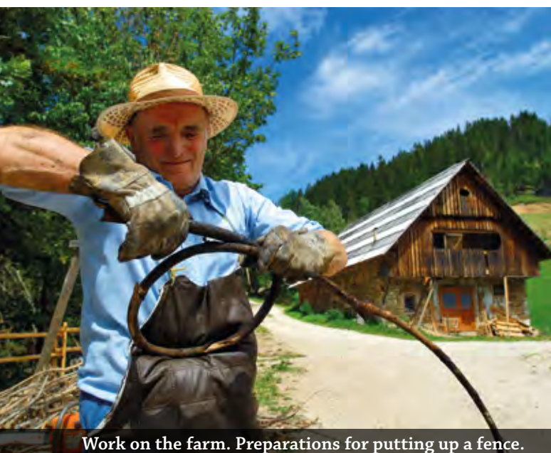
Work on the farm. Preparations for putting up a fence.

Also worthy of respect are the surviving traditions: the sound of the zither on mountain farms, the touch of felt products made from the wool of the autochthonous Jezersko-Solčava sheep, the ancient churches and chapels, the huts of charcoal burners and woodsmen, and every greeting from the hardy locals.