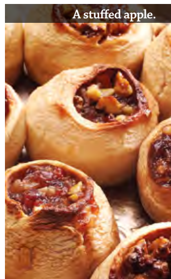
A stuffed apple.

Discover natural and cultural features of past and present. Admire the beauties of the landscape, Alpine flora, animals in the wild, architectural and ethnological heritage. Respect the coexistence of nature and people. And enjoy the homeliness of villages, the hospitality of the inhabitants, the comfort of hotels, guest houses and open farms! Enjoy typical local dishes. Try a local speciality with protected designation of origin: SAVINJSKI ŽELODEC (stuffed pig's stomach). Eat your fill of Solčavsko savoury strudel and ravioli with various fillings; MASOVNIK, a flour-based dish made with butter, milk and cream; SIRNEK, a soft cheese aged in a special way to give it a sharp taste, also used to make a special soup called SIRNICA. Home-made sweets from cakes, to PUTRTOHI, to fruit breads accompanied by home-made fruit juices, teas and brandies. Allow yourself to be surprised by the natural quality of all the other dishes: organic farms produce fruit and vegetables that have a really full flavour thanks to the pure and unspoilt environment. Fruits of the forest also enrich Solčava menus. In Solčavsko you can taste the traditional coexistence with nature at every step!